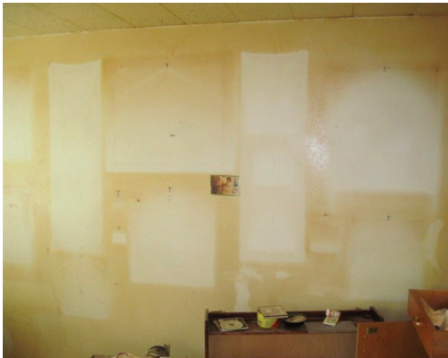
The tar in cigarette smoke stains walls—this requires additional restoration and extensive cleaning.